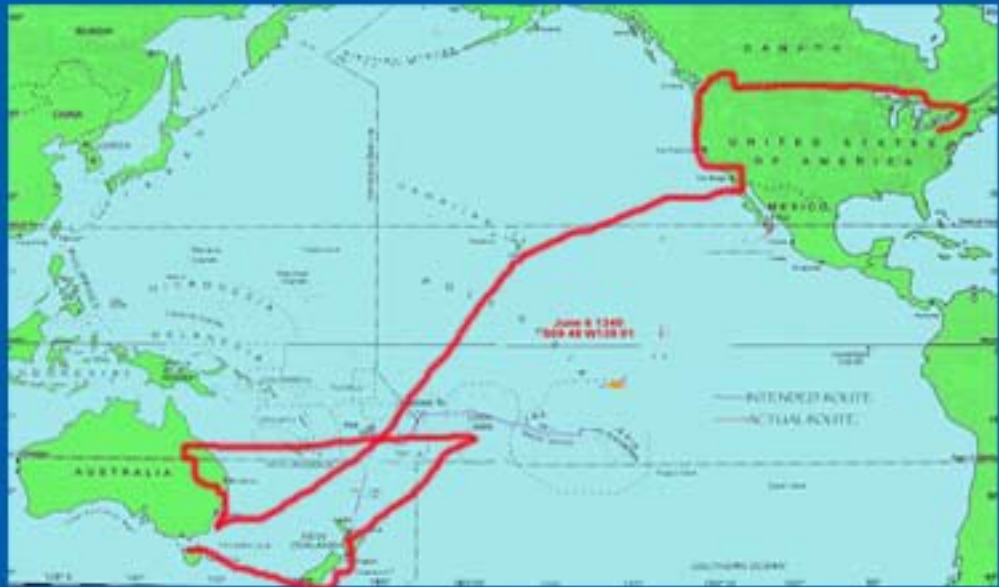
Where we are travelling until the end of June

our customers and subscribers. We have had a good few months setting up the company and look forward to offering an even better product in the summer. Until then, enjoy your travels.